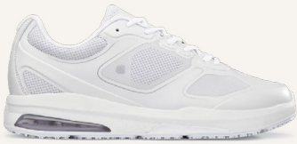
Evolution II White: 28289